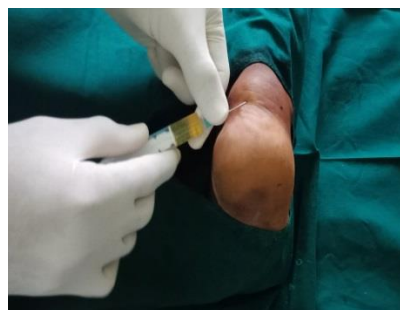
Figure 3: Technique of PRP injection to left retrocalcaneal bursitis.