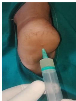
Figure 4: Technique of PRP injection to right plantar fasciitis.