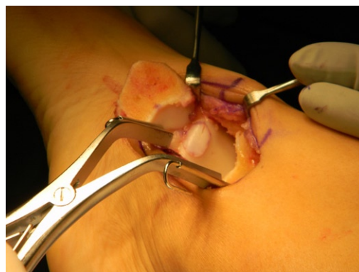
Figure 3 Autologous osteochondral graft.

Autologous osteochondral grafts (OATS) involves replacing the damaged tissue on the talus, with a healthy osteochondral graft harvested from a non-weightbearing portion of the ipsilateral knee (Figure 3). This procedure has predominantly been advocated for treating large cystic lesions, or in patients who have failed previous