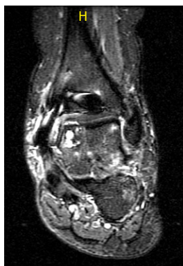
Figure 4 Magnetic resonance imaging showing cyst formation following autologous osteochondral graft surgery at 3 mo post-operative.

MRI and SPECT-CT findings. While the patients reported a satisfaction rate of good to excellent in 92% of cases, and mean AOFAS score improved from 45.9 pre-operatively to 80.2 points post-operatively, radiological findings were less encouraging. On MRI, there was evidence of recurrent cyst formation in 75% of patients. SPECT-CT showed that some level of cyst formation in all cases.